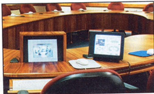
Participants can bring a laptop computer and plug into the system.