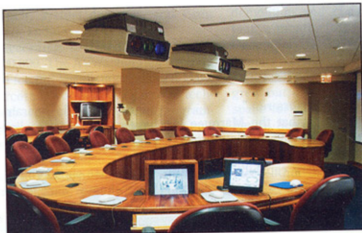
The room used to serve as a hospital. It was completely gutted and rebuilt.